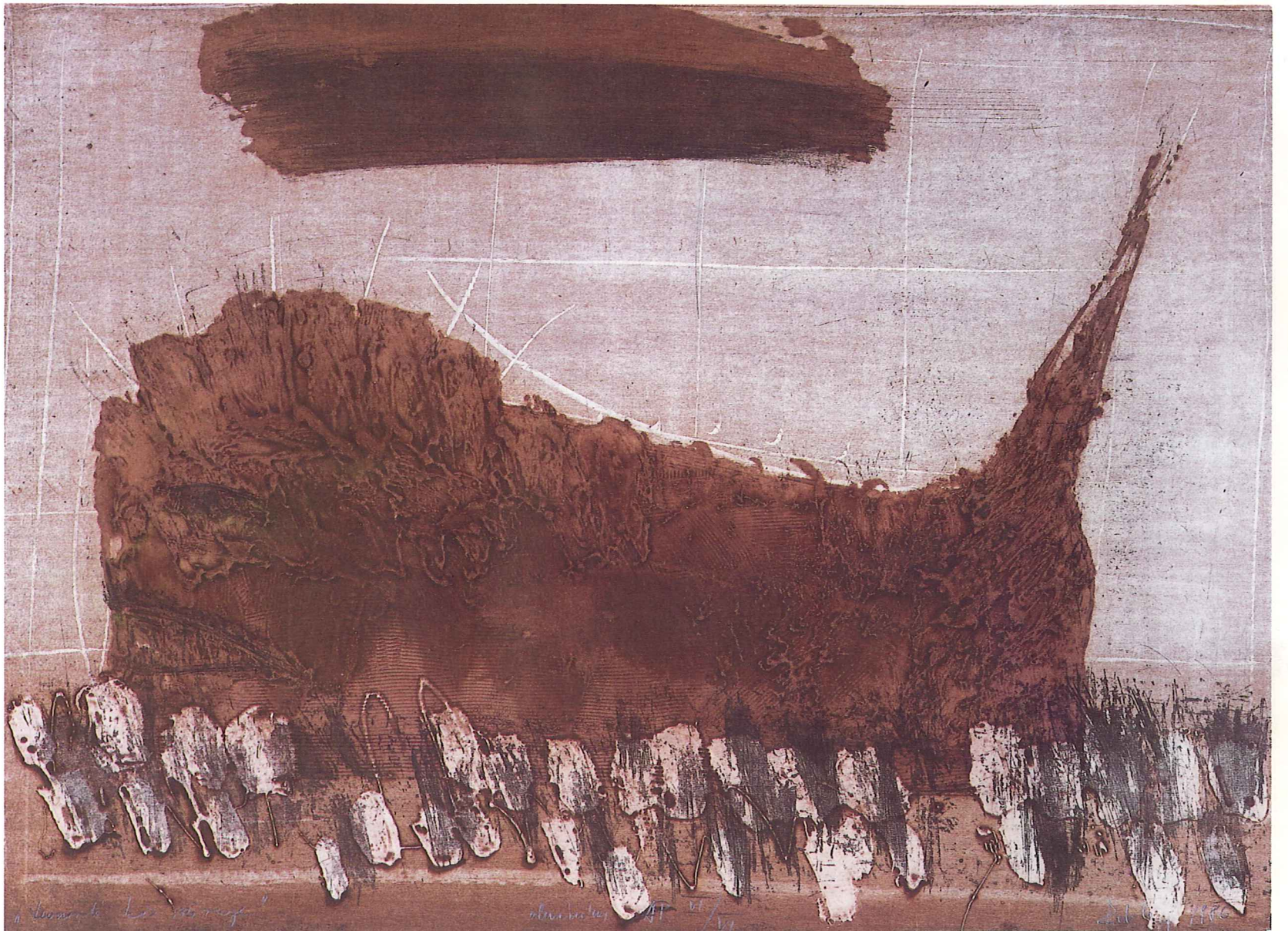
레오나르도의 작은 괴물 (Leonardo's Little Monster) 1986, 68×48cm Alu-etching