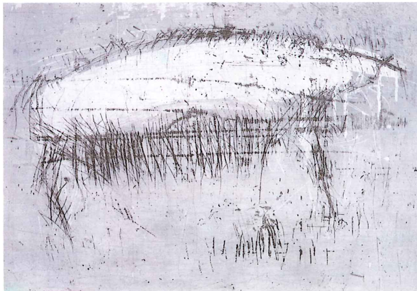
1. 외뿔 (Unicorn) 1985, 50×70cm Alu-etching